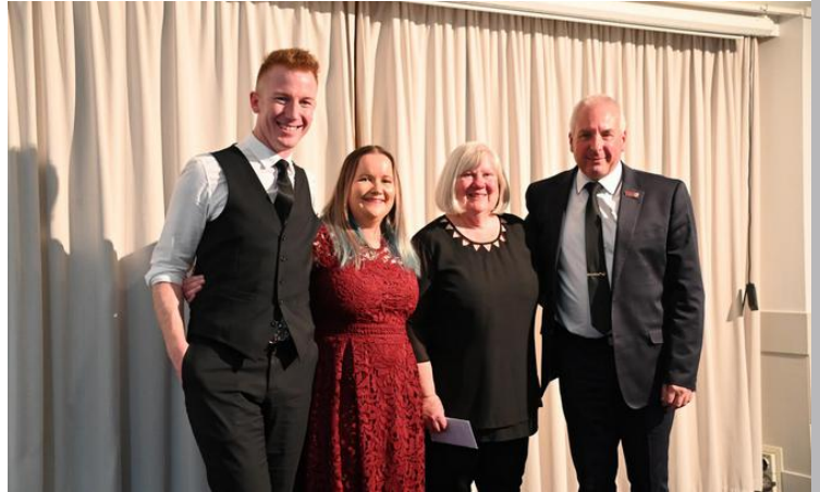
Left: Kicking off the formal sessions with our welcome. Right: our Conference planning team at the awards night.