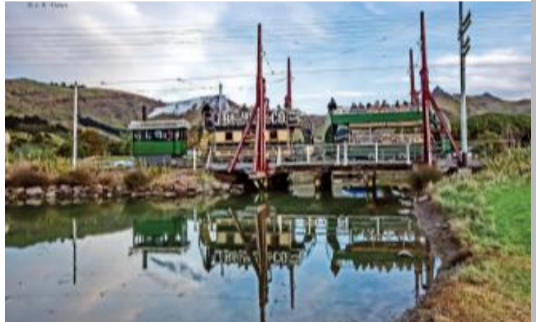
Left: Kitson at dusk having just arrived at the Square Shelter. Right: A neat photo of the consist crossing the rebuilt Ferrymead Bridge.