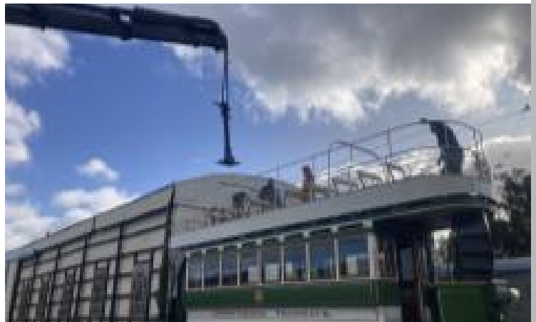
Left: The consist at Square Shelter, and the CRS consist being hauled by F13. Right: The pole base being lifted from Tram 26 to be repaired.