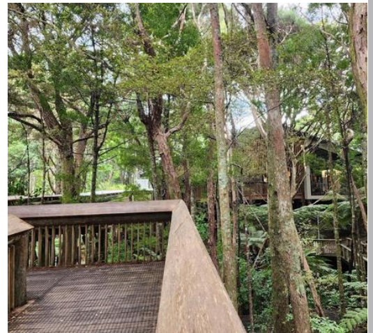
Left: the front of one of the waka. Middle: The flagstaff where the treaty was signed. Right: The tree top style walkway.