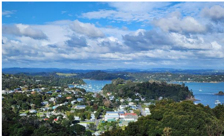
Left: The ferry over to Russell. Right: Overlooking Russell from Flagstaff Hill.