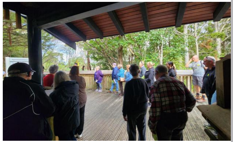
Our group at the Waitangi Treaty Grounds