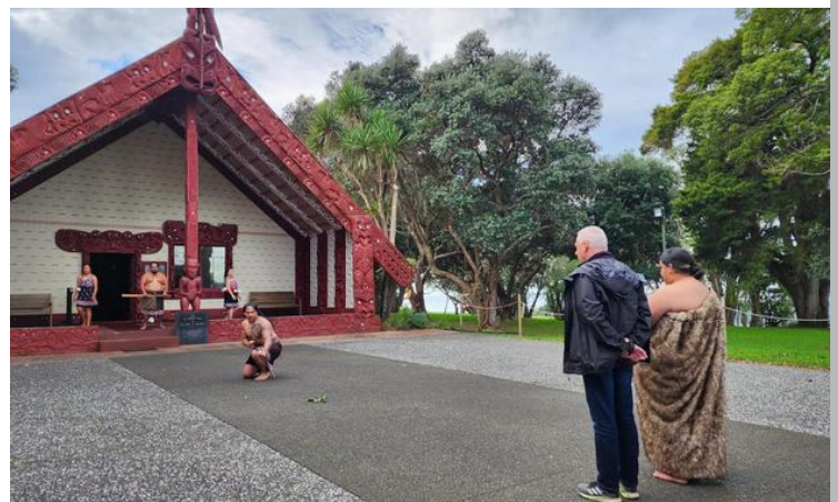
Left: the Treaty House. Right: the offering at the Meeting House.