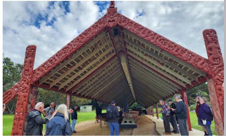
Checking out the Waka