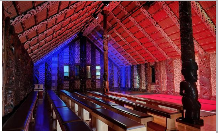
Left: displaying some of the combat and defense skills. Right: inside the Meeting House.