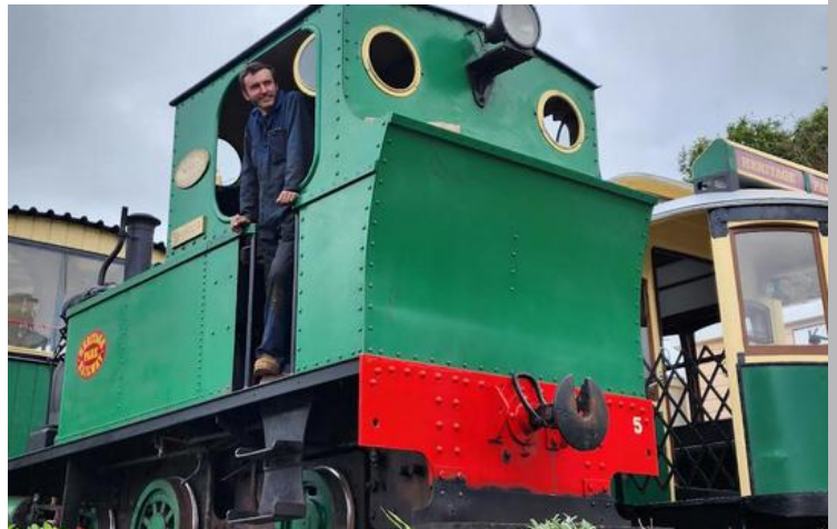
Whangarei Steam and Model Railway Club