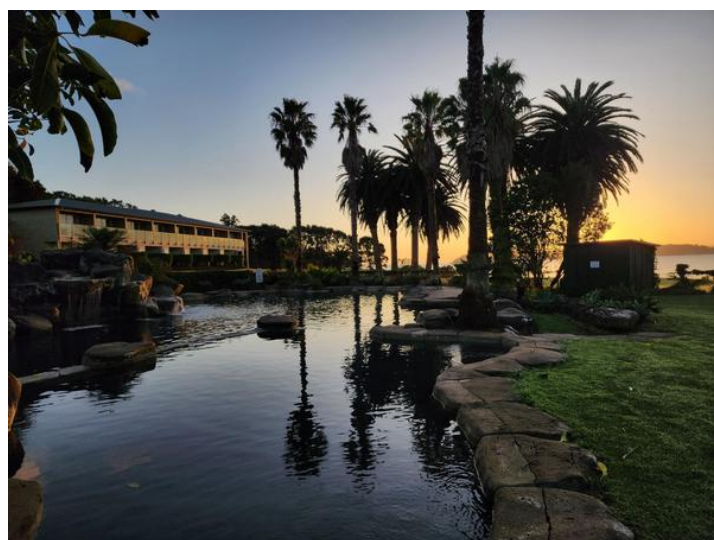
One of the many beautiful sunrises we saw at the Copthorne Bay Of Islands.