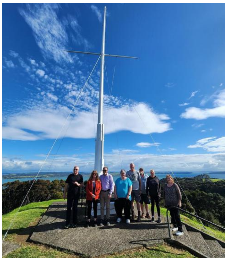
Left: Flagstaff Hill (where Hone Heke and his allies cut down the flagstaff). Right: Our Russell tour group.