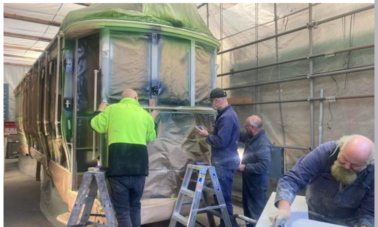
Left: Bus 612 out on tour. Right: The HTT staff sanding 24 ready for the cream colour to be applied.