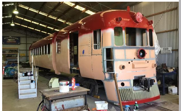
Twinset Rm121 gets some carnation red applied.