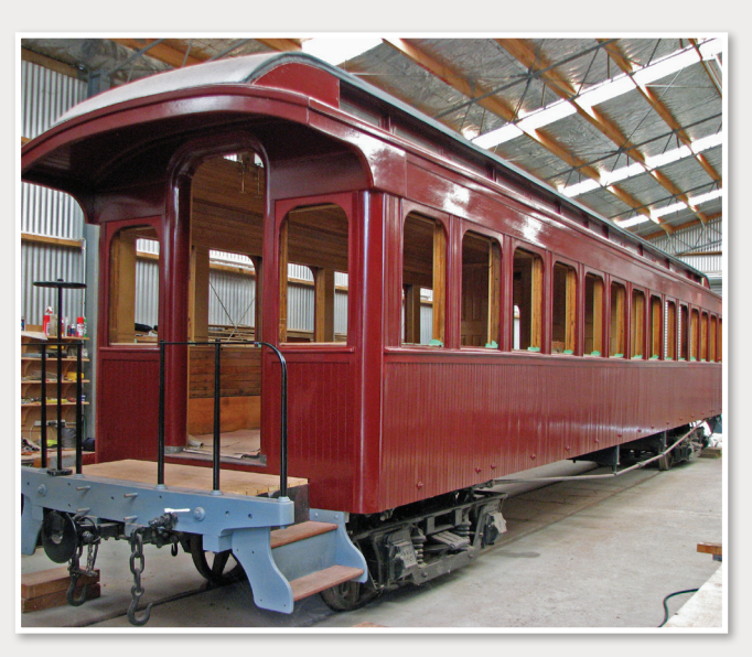
Wellington & Manawatu Railway Company carriage 48 under restoration at the Society's Silverstream workshop.

The Society has an extensive workshop and storage facility located at Silverstream in Upper Hutt. This facility houses several wagons, hand jiggers, motor trollies and three Wellington & Manawatu Railway Company carriages, two of which are undergoing restoration.