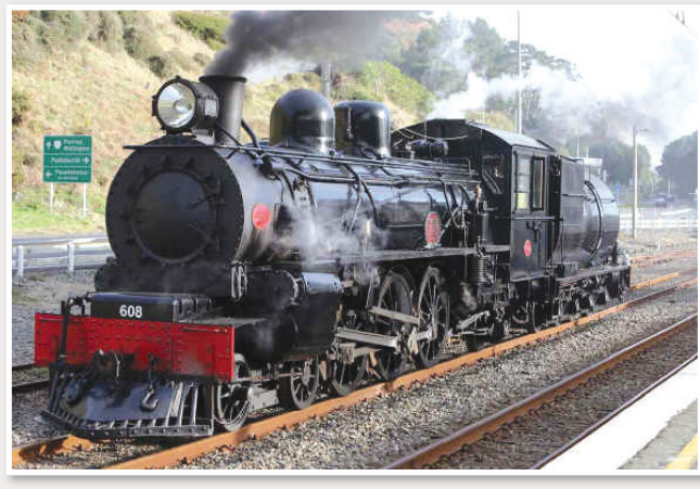
A<sup>8</sup>608 at Paekakariki.

The Society owns three historic locomotives, three historic railway carriages and a number of assorted wagons and ancillary equipment.