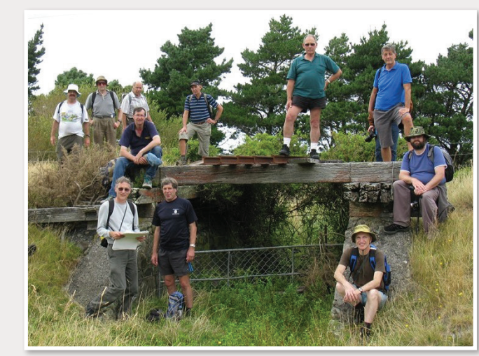
Wellington group members pause at an old bridge on the abandoned railway formation between Cross Creek and Speedy's Crossing near Featherston.

Activities vary from place to place. They may include slide, film or video presentations at evening meetings, talks on railway subjects by invited guests, tours of repair facilities or depots, walks on abandoned railway formations or bush tramways, or visits to other places of railway interest.