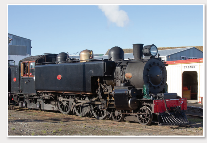
WAB 794 stabled at Feilding.

The three locomotives are AB608 Passchendaele. currently operated by Steam Incorporated at Paekakariki, W<sup>AB</sup> 794, currently operated by Feilding and Districts Steam Rail Society.